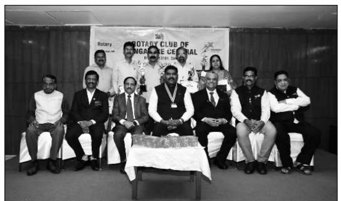
The Prize Winners of the 19 th Annual Rotary Dist 3181 Rotary Awareness Quiz