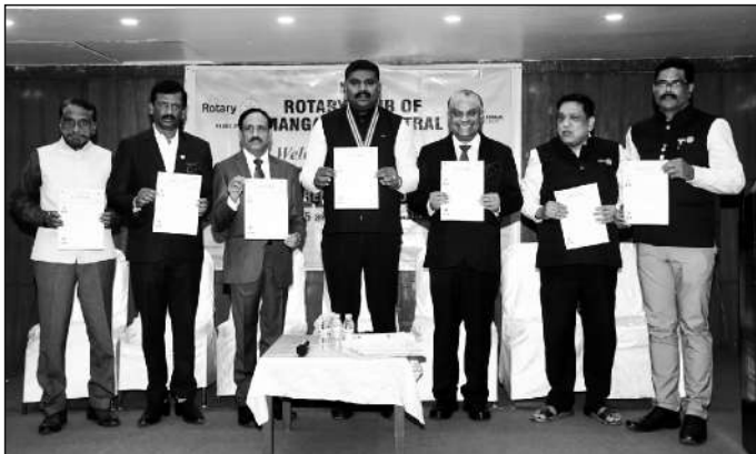
Release of Centor by the hosts of the Family Dinner Meeting for February