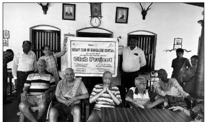
Project Hongirana conducted by our Club.