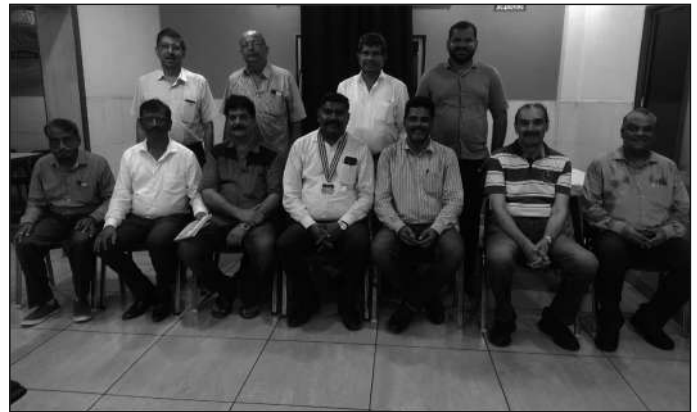
Board Meeting of the Club for March