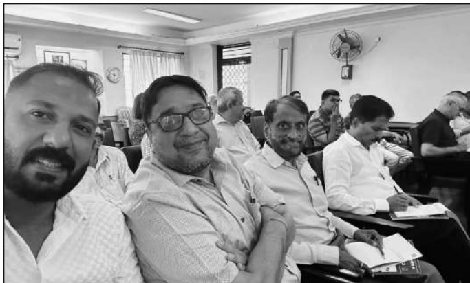
Our Club delegates seen at Pre PELS/Pre SELS, Zones 123 , RI District 3181