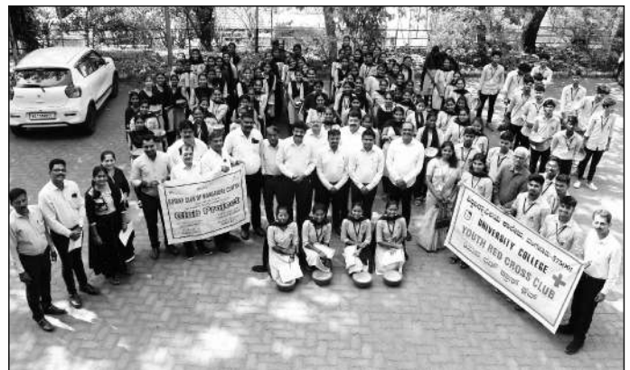
Project Jeeva Jala Ulisi Abiyana