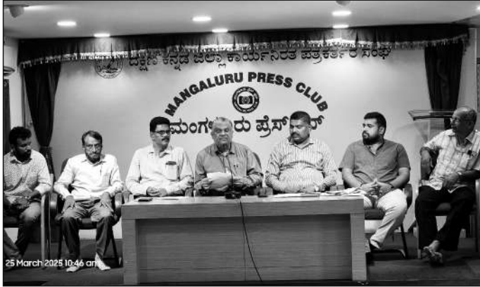
Press Conference conducted by our club regarding Vandana Award program